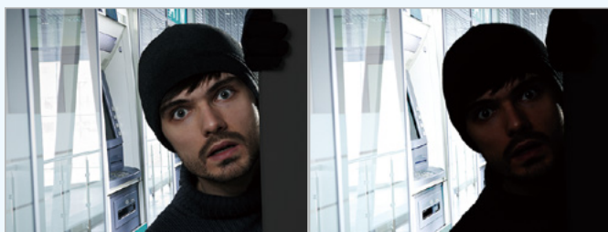
With WDR Pro