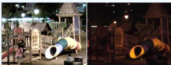
With SNV Camera